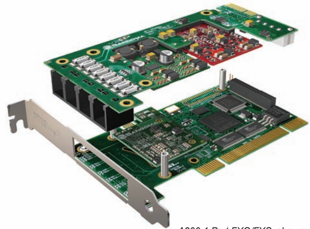
A200 4-Port FXO/FXS, shown with Hardware Echo Canceller, disassembled.

Like all the cards in the award-winning Sangoma AFT Series Product Line, the A200 and Remora™ system's architecture is shared with Sangoma's A101, A102, A104, and A108 cards, ensuring common 3.3 V or 5 V, high performance, universal PCI or PCI Express compatibility, and crash-proof field